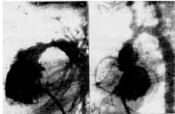
Fig. 3 - Postoperative cineangiogram.

ditions. Fifty days after surgery he was re-evaluated being considered in very good conditions without any cyanosis. He weighs presently 5,500 g against 3,700 g at the time of the surgery.